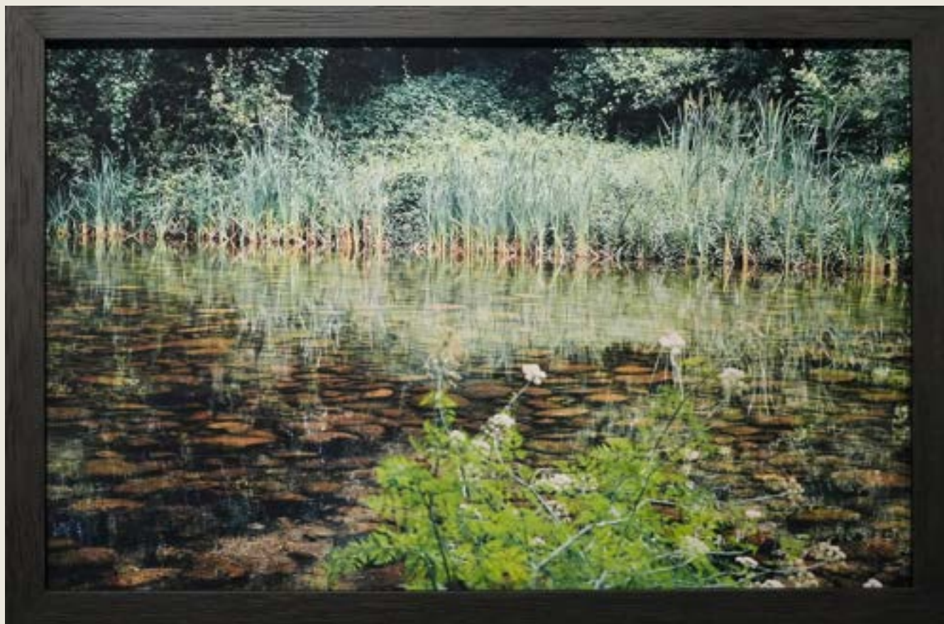
A paisagem de Monet / Monet's Landscape